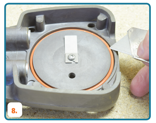
Remove the cylinder o-ring(s) from the bottom of valve plate(s) and install new o-rings.