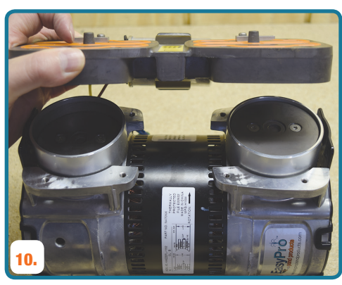
Check that orientation of the valve plate(s) with ports is correct and place over cylinders.