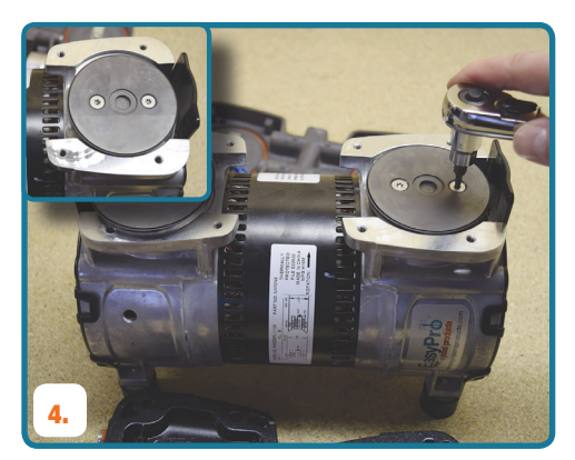
Remove screws from cup retainer plate with T15 Torx driver. Discard old cups and retainer screws.