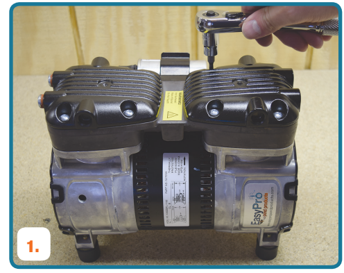
Remove screws from the head of compressor using T25 Torx driver, remove the head