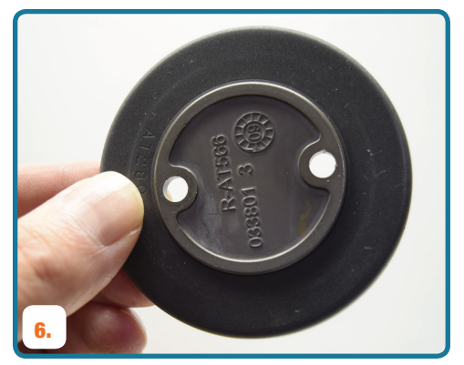
Remove new piston cup(s) from protective cardboard packaging. Set new piston cups onto retainer plate, these parts will sit flat against each other.