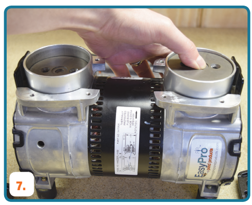
Press retainer plate with piston cup into cylinder all the way to the piston. The cylinder can be rotated to align the screw holes. Apply thread locking compound (Loctite<sup>®</sup> 222) to retainer screws, torque screws to 10-13 inch-pounds.