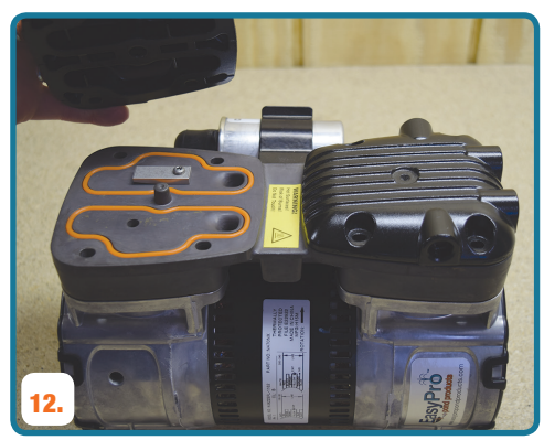
Reinstall head over valve plate(s) checking that orientation with ports is correct. Torque screws to 50 inch-pounds